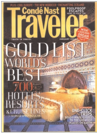
CONDÉ NAST TRAVELER, JANUARY 2007