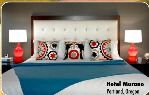
Hotel Murano Portland, Oregon